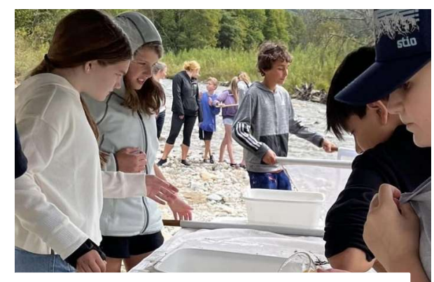
Collecting waterbugs to gauge water quality