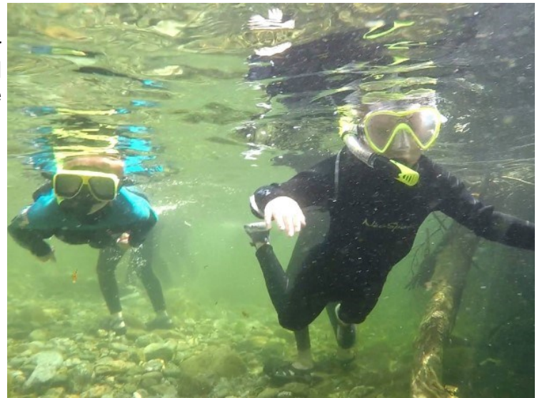
The White River is a popular recreational destination.