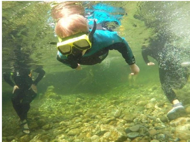
The White River is a popular recreational destination.