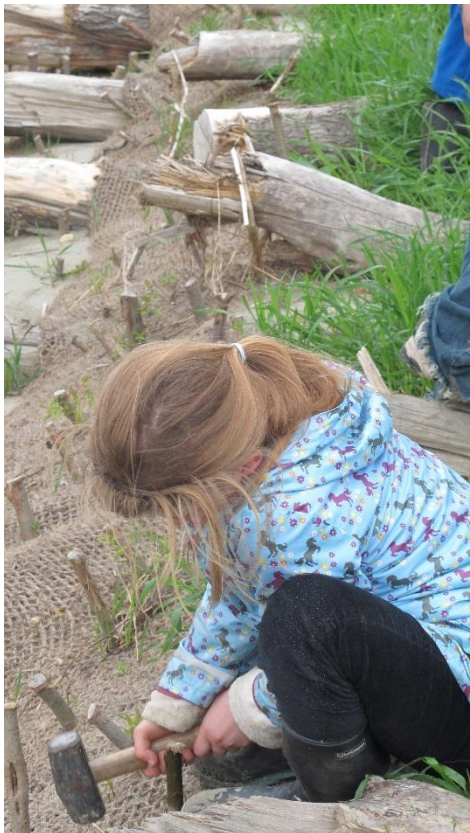
A Pomfret student pounds willow stakes in South Royalton. Each stake will grow into a lush and resilient willow whose roots will help stabilize the bank!

HMMS' Team Altitude has enriched their study of riparian buffers by participating in MWR's Riparian Track & Sign unit this winter and planting trees to improve the existing riparian buffer at Watson Park this spring.