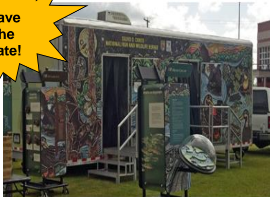
The Wow Express in action!